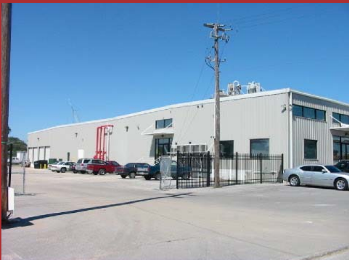
Fenced Loading Area