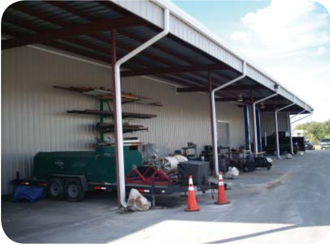
Covered Work Area 22' x 155'