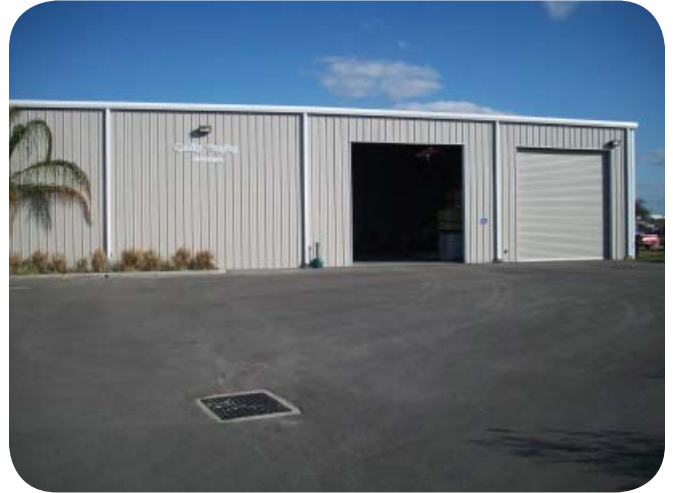
4 @ 16' x 16' Grade Level Doors