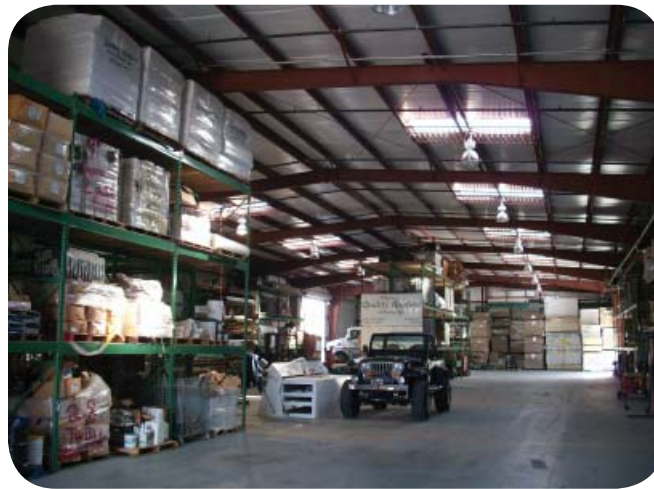
22' Clear Ceiling Height in the Warehouse