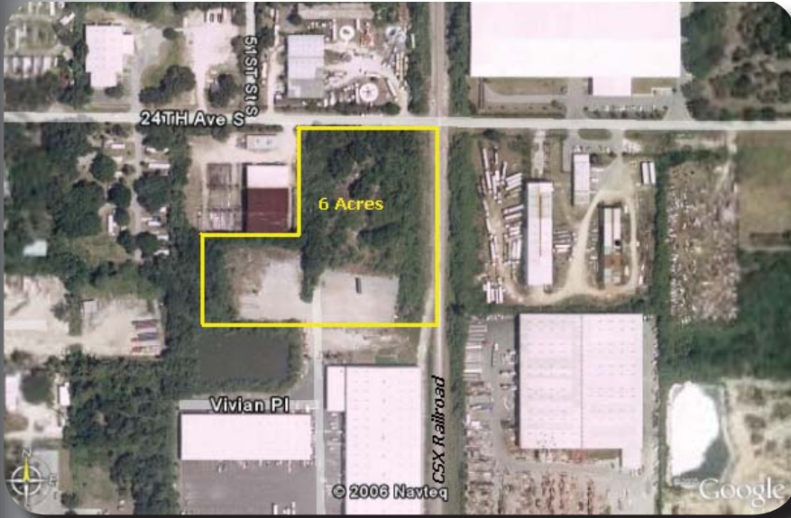
24th Avenue South Tampa, FL